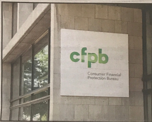
UNDER SIEGE: The CFPB was created by the Dodd-Frank Act, which faces GOP threats.