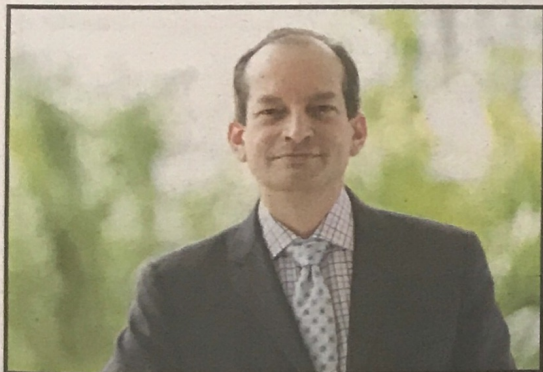
LABOR DEPT. NOMINEE: FIU College of Law Dean Alexander Acosta.

Trump's labor secretary choice made student recruitment a personal mission.